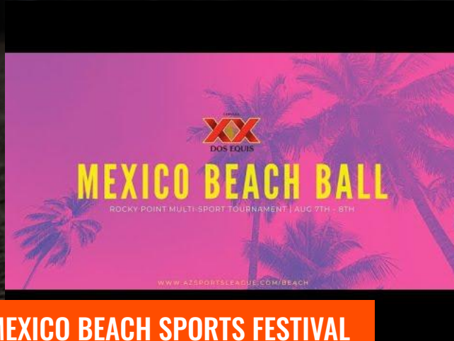
MEXICO BEACH SPORTS FESTIVAL