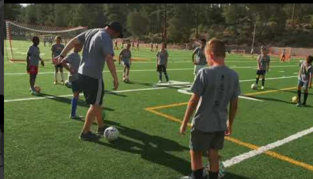
ARIZONA YOUTH SOCCER CAMP