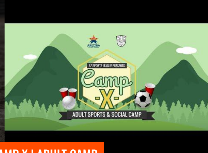
CAMP X | ADULT CAMP