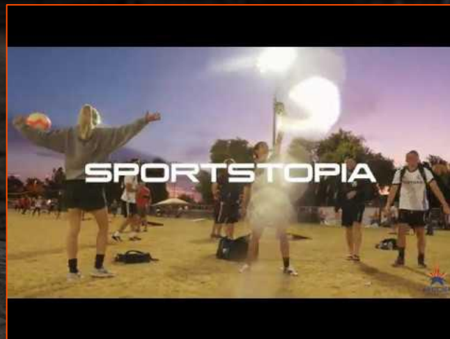
SPORTSTOPIA | SPORTS FESTIVAL 2019